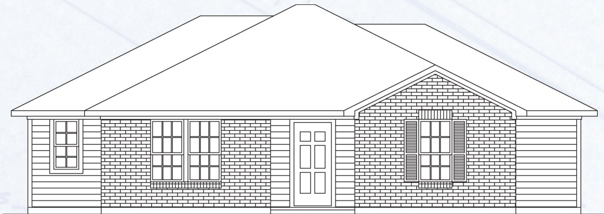
B - 1584 sq.ft. 44' - 4" W x 50' - 1.5" D

VA, FHA, USDA and Conventional Financing