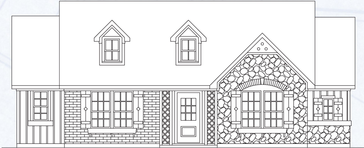
A - 1572 sq.ft. 44' - 4" W x 50' - 1.5" D